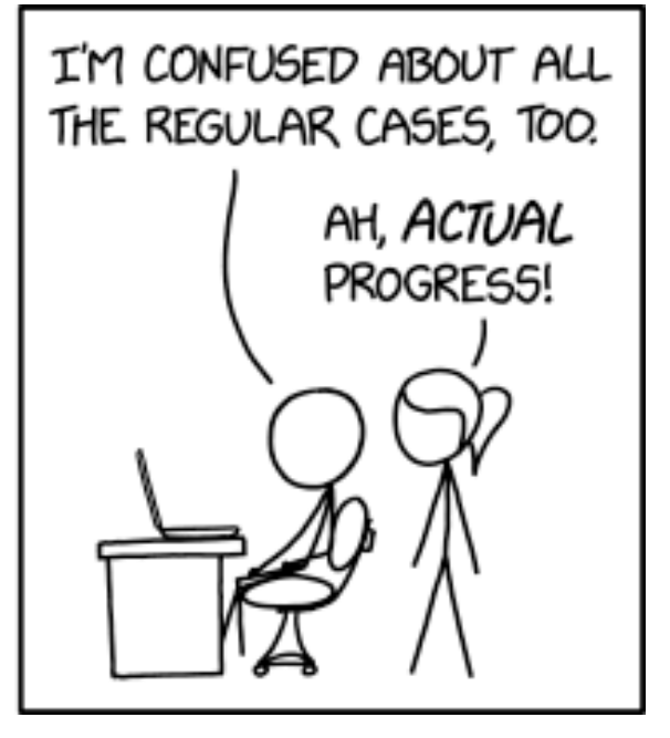
Comic by XKCD - https://xkcd.com/2797/